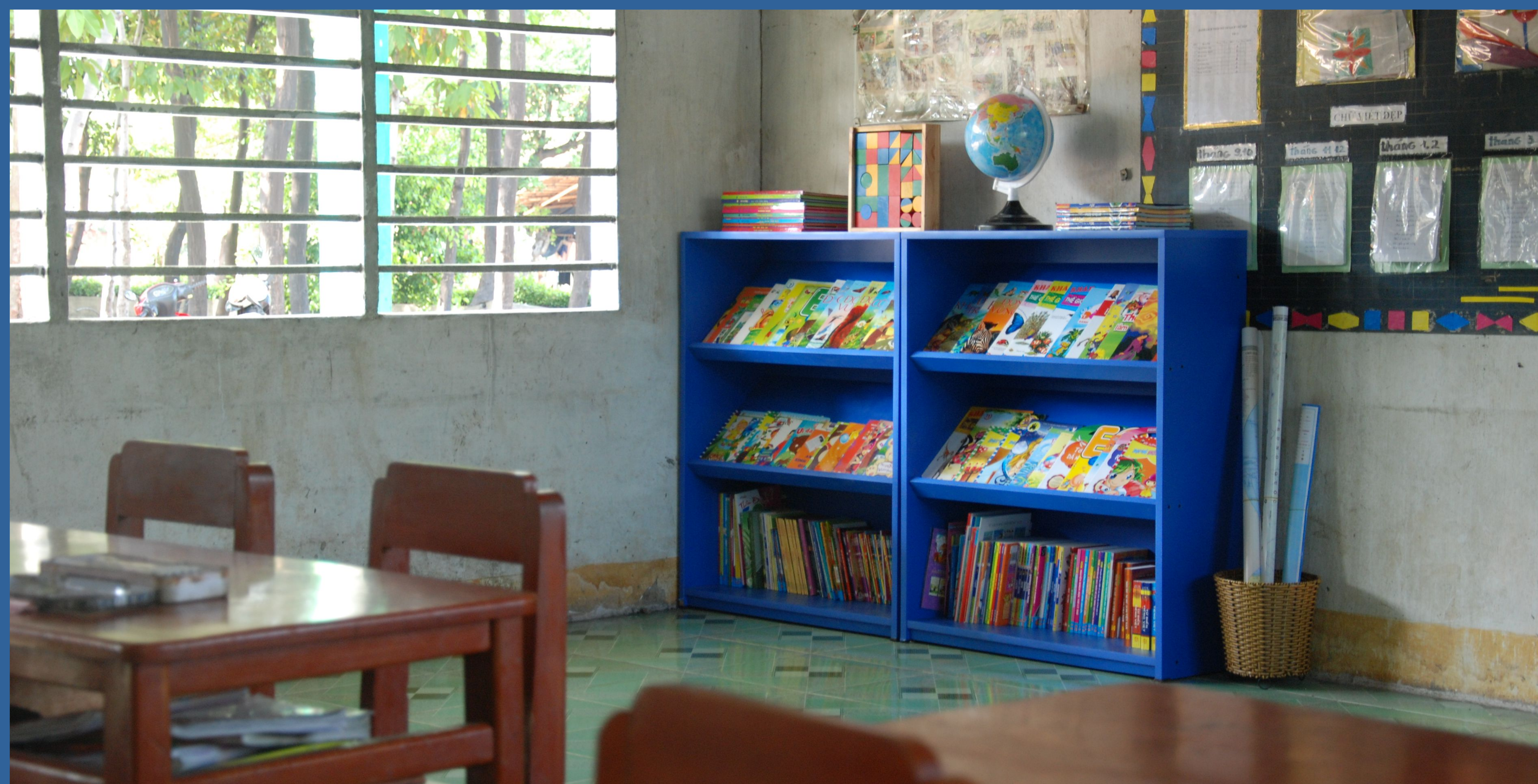
Reading Corners for small schools