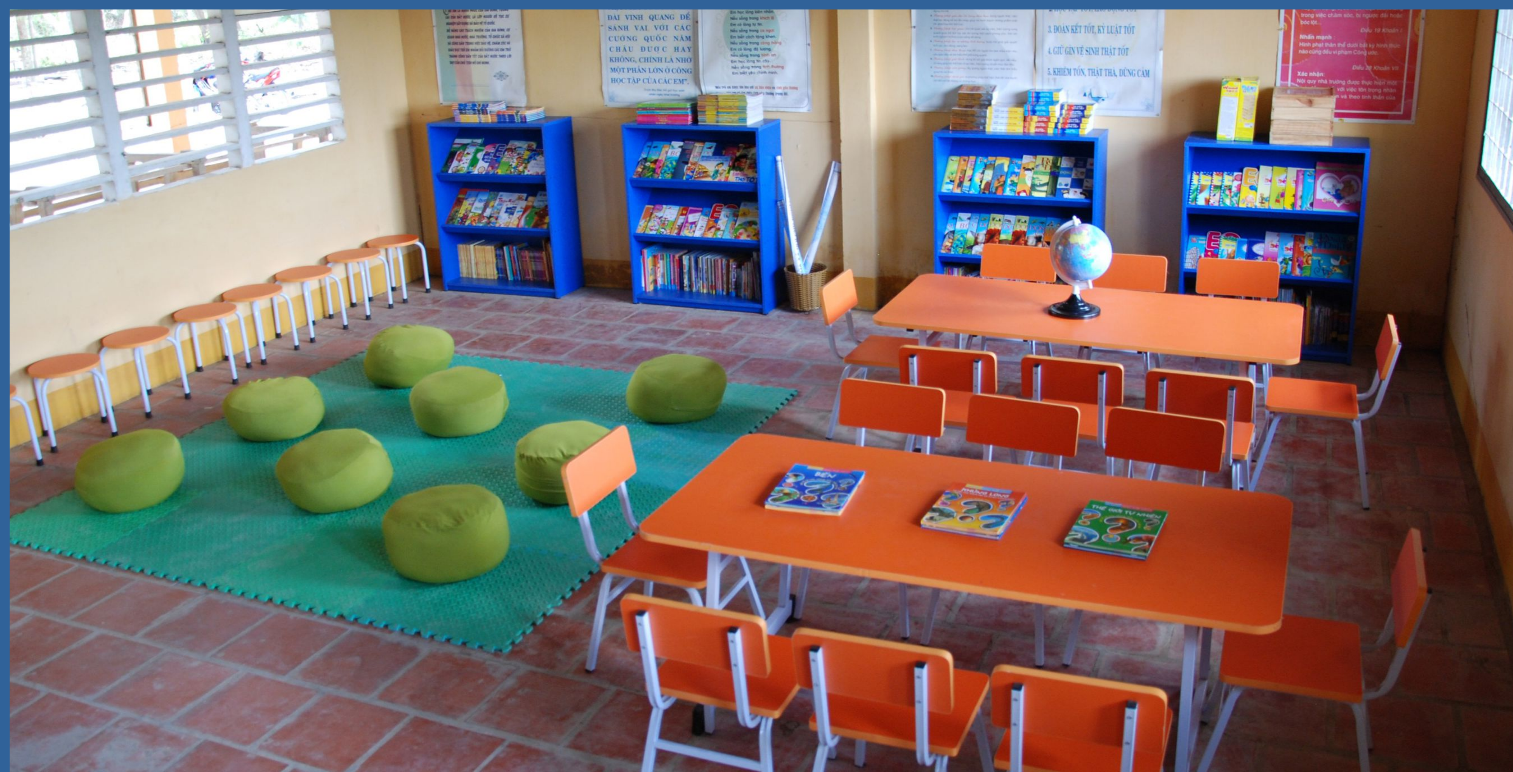
Reading Rooms for large schools